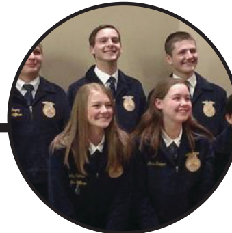
Chapter and District Banquets