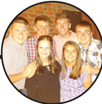
International Leadership Seminar for State Officers