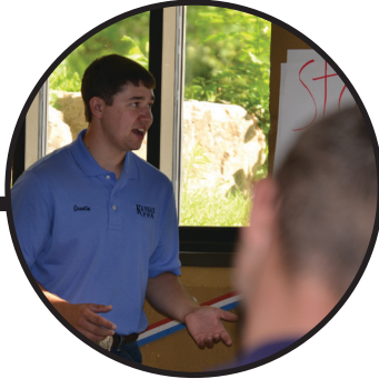
State Conference for Chapter Leaders