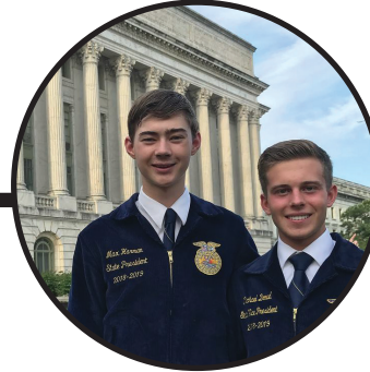
State Officer Summit (Washington D.C.)