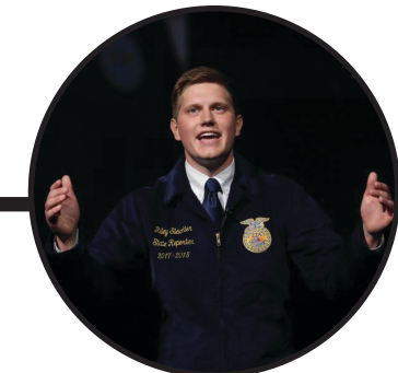
State Convention and Retirement

OFFICERS COMMIT NEARLY 300 DAYS OF THE YEAR TO FFA