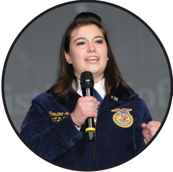
Officer Candidacy and Election